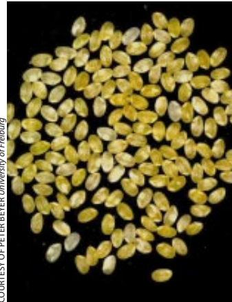
"GOLDEN RICE" contains betacarotene, which adds color as well as nutrition to the grain.

Golden rice is not yet ready to be commercialized, however. Much testing still lies ahead, including analyses of whether the human body can efficiently absorb the beta-carotene in the rice. Testing is expected to last at least until 2003.